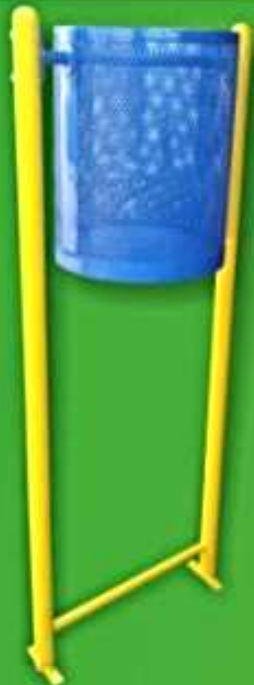
TILTING BIN STAND