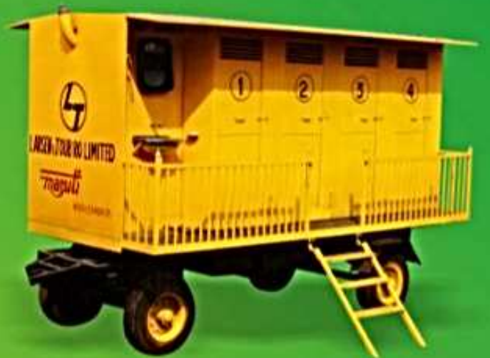
MOBILE TRAILER VEN