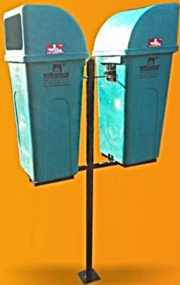
SINGLE POLE MOUNTED BIN